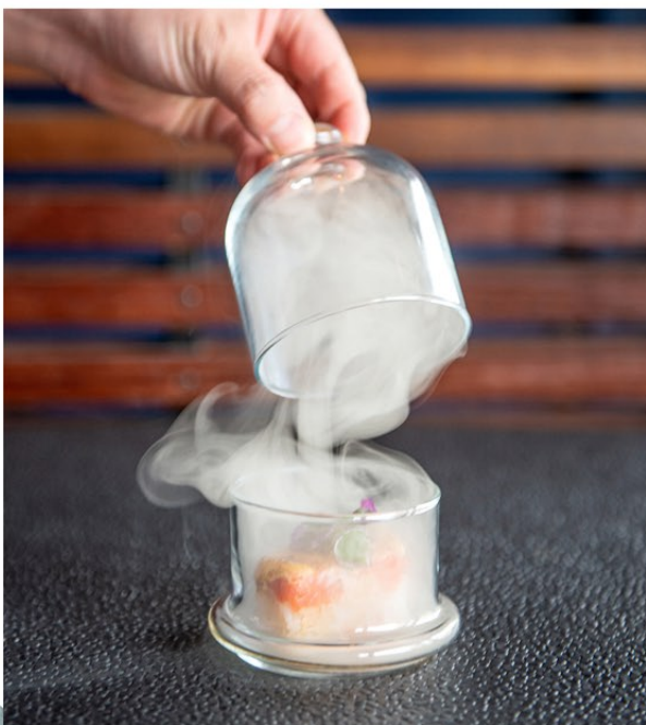
Smoked Oshi

★ Best Casual Japanese Restaurant ★ Vancouver Magazine Restaurant Awards 2024